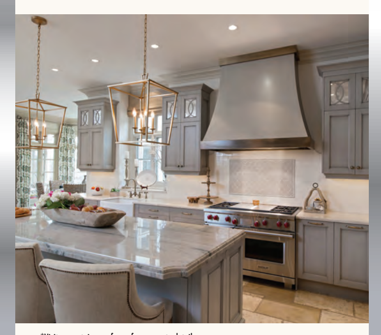
*Visit www.stain-proof.com for warranty details.